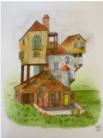
Magical Extension - Andy , watercolour and pen .