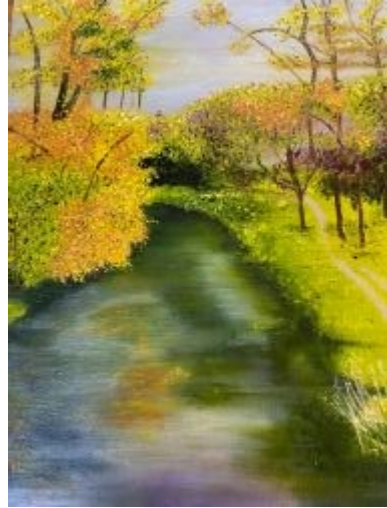
Autumn river - Sharon , oils .