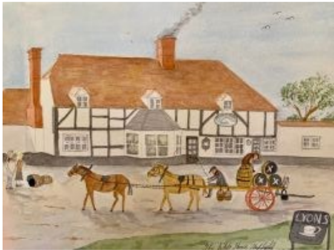
The White Horse, Ampfield, in bygone days - Nick, watercolour.