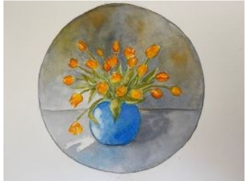
Vase of Tulips - Alison , watercolour.