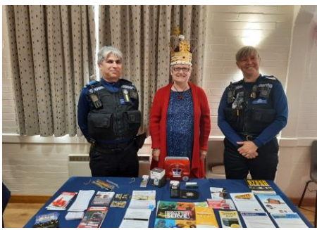
Above: Ampfield Jubilee Market