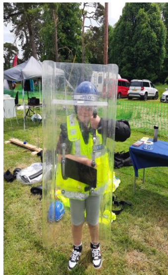
Below right: Braishfield Jubilee picnic