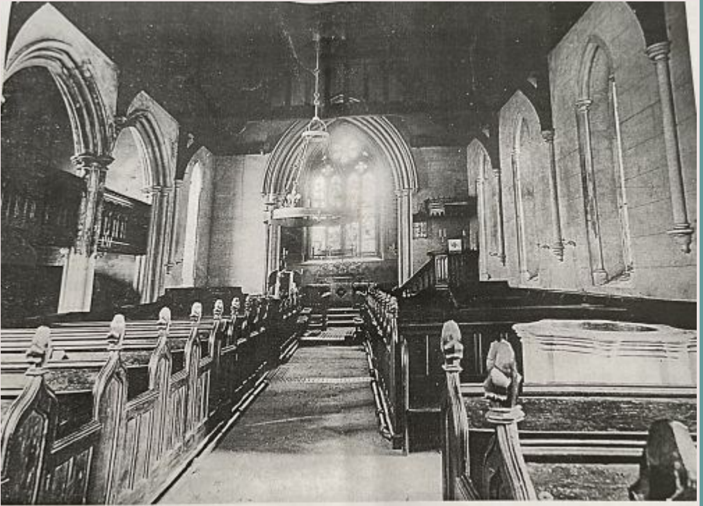
St. Mark's in 1866

Note the gallery, the corona of candles hanging from the roof timbers, the doors on the pews and the pulpit with sounding board.