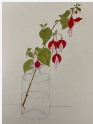
Fuchsias - Pauline, Watercolour.