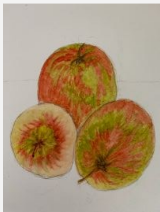
Apples from my garden - Jenny, watercolour.