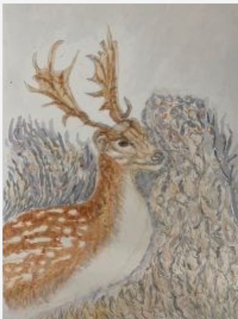
Fallow deer in Autumn - Jenny, watercolour.