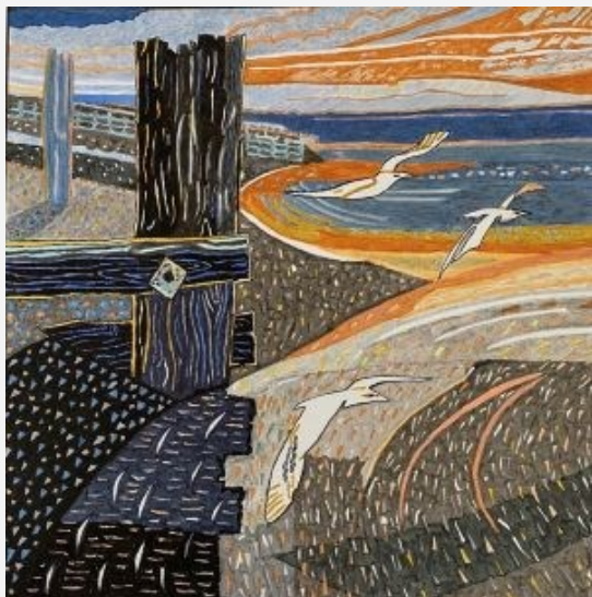
Autumn fly past - Graham, ink.