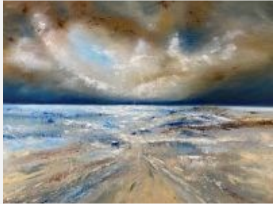
Silver Sea - Sharon, oil.